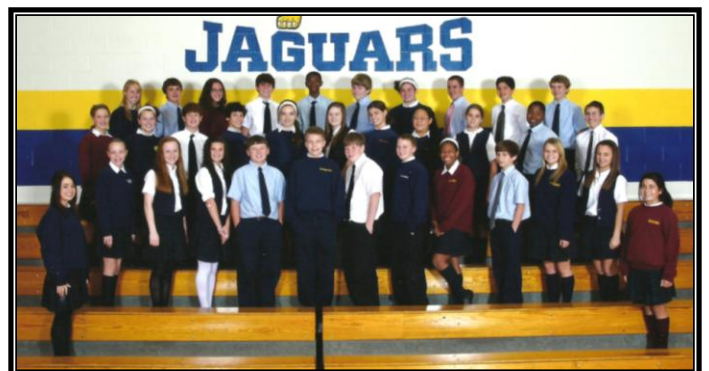
SHJA Class of 2011