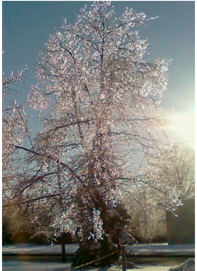
Picture taken by exit of SHJ driveway in February, 2011

Now that all the excitement of Christmas and New Years has passed, we have spring to look forward to! The snow has melted and it is getting warmer outside. Spring is one of the busiest seasons for our school, especially for the junior high. We have had Catholic Schools Week and the talent show already. We look forward to Stations of the Cross during lent and May crowning. The junior high also has the play, High School Musical, this spring. Of course, we look forward to having spring break too! I think this is going to be a great spring for Sacred Heart of Jesus Academy.